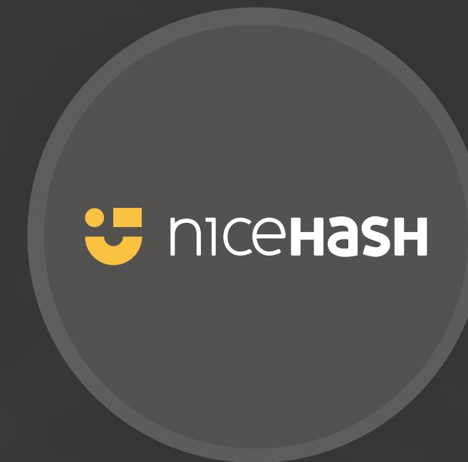
Hash Power Broker

By entering this partnership, mining manufacturers gain recognition and co-marketing opportunities by the world's largest hash power broker and marketplace.